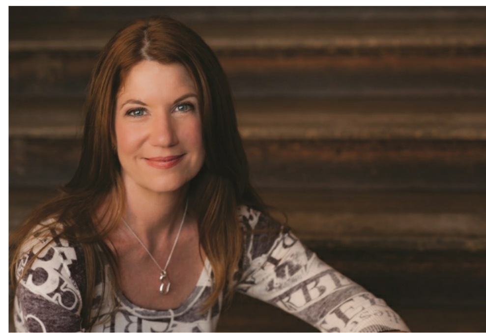
Author Susan Wiggs